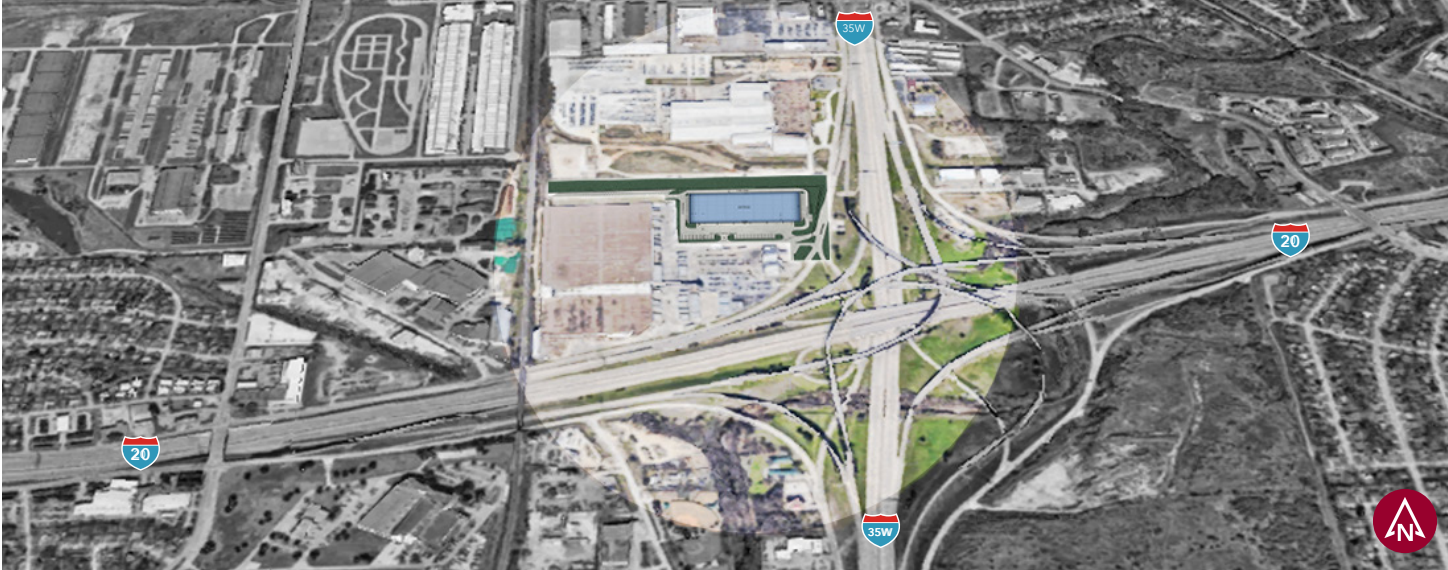
All information furnished regarding property for sale, rental or financing is from sources deemed reliable, but no warranty or representation is made to the accuracy thereof and same is submitted to errors, omissions, change of price, rental or other conditions prior to sale, lease or financing or withdrawal without notice. No liability of any kind is to be imposed on the broker herein.